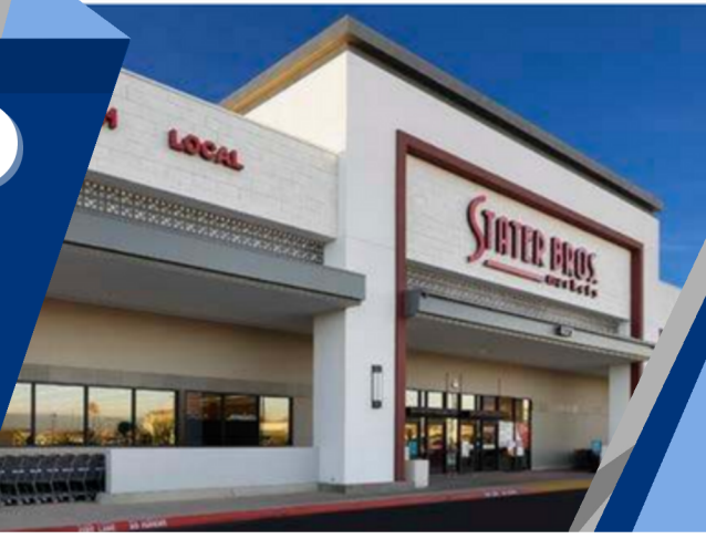
Stater Bros. at Town Center at The Preserve

QUARTERLY REPORT / DECEMBER 2024 WWW.CHOOSSECHINO.ORG