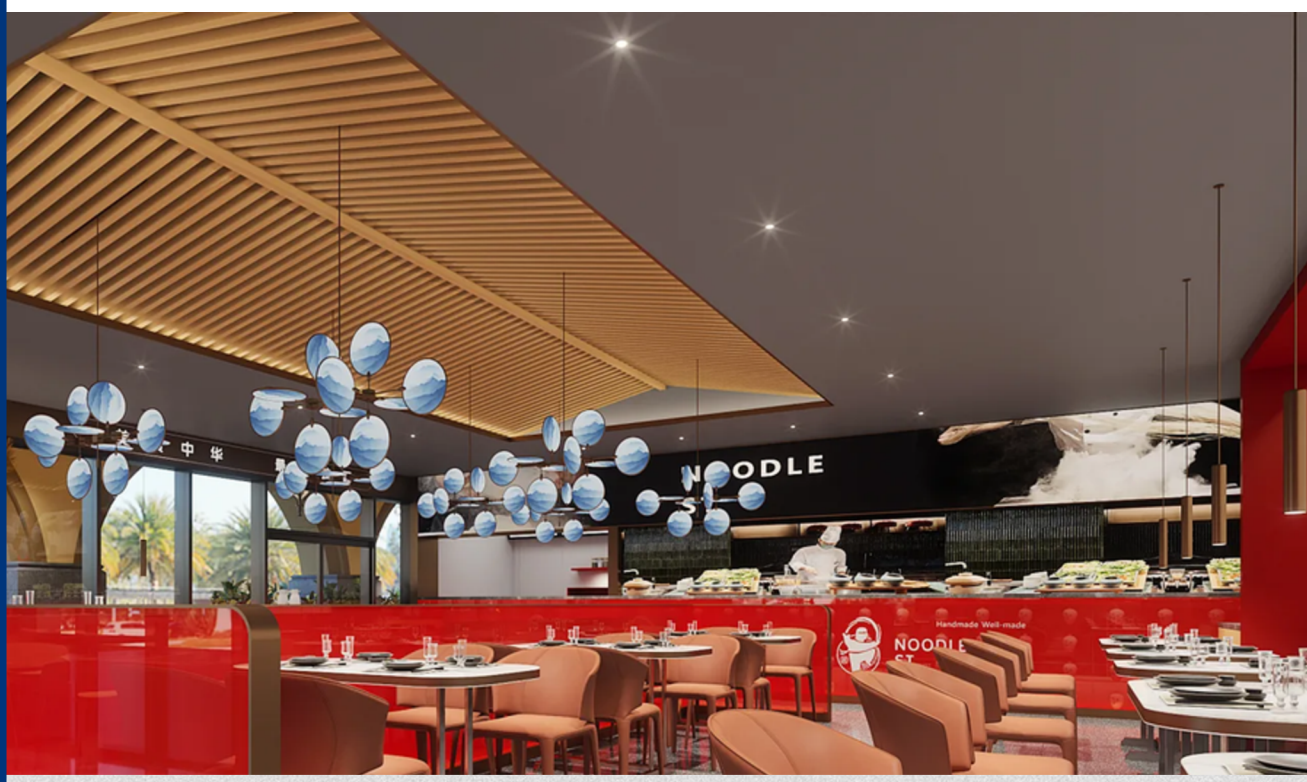
Now Open: Chino Spectrum Marketplace 3926 Grand Ave Ste E, Chino, CA 91710