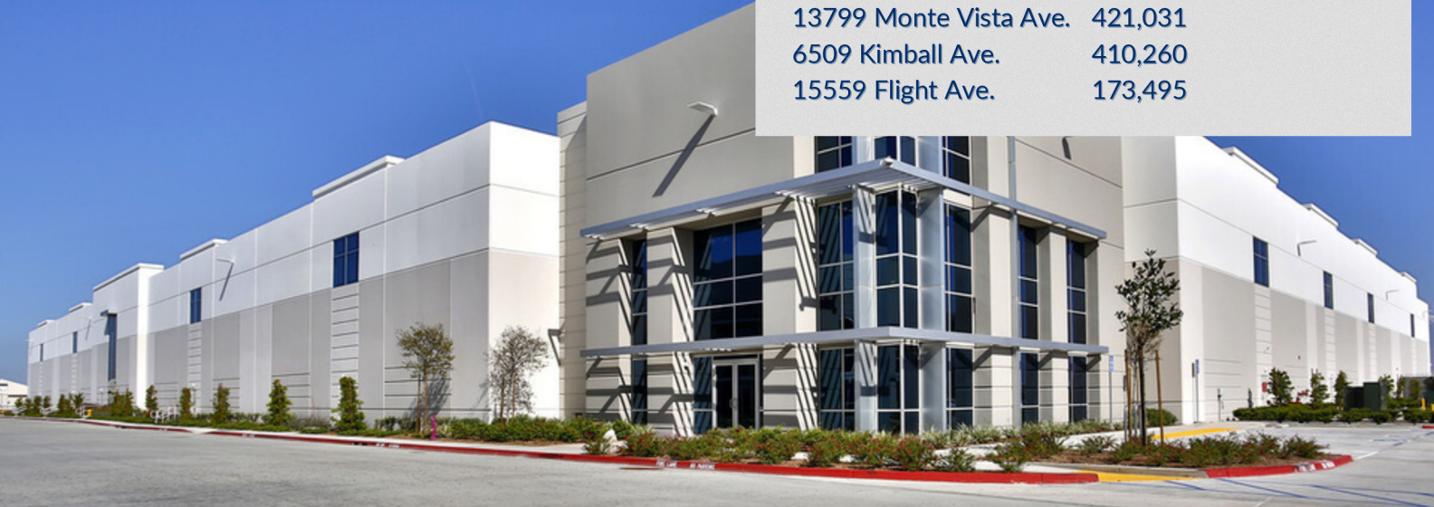
Kimball Business Park - Building #1