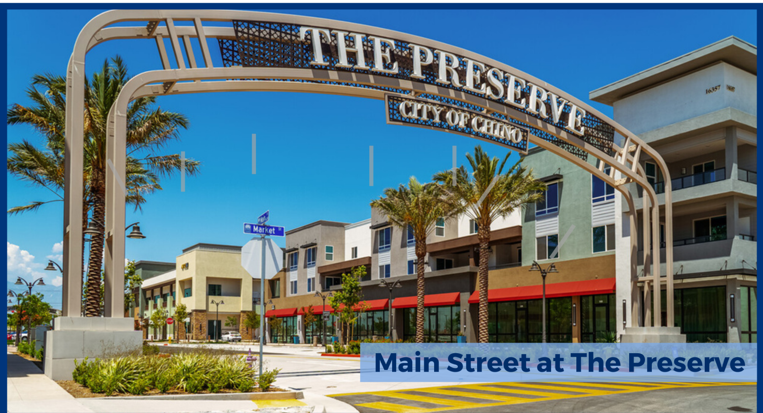
Main Street at The Preserve

Welcome to Main Street, the most exclusive retail destination in Chino, offering a 146,830SF shopping experience unlike any other. Designed to elevate lifestyles through engaging common areas, modern amenities and an eclectic mix of tenants. Main Street is the perfect opportunity for local businesses looking to expand, with both office and retail spaces available. Main Street is also an extension of the popular Town Center at The Preserve, home to well-known names like Stater Bros. Markets, Kenwood's Kitchen & Tap, Panera Bread, and Starbucks. This vibrant location is set to become Chino's go-to spot for shopping, dining, and more.