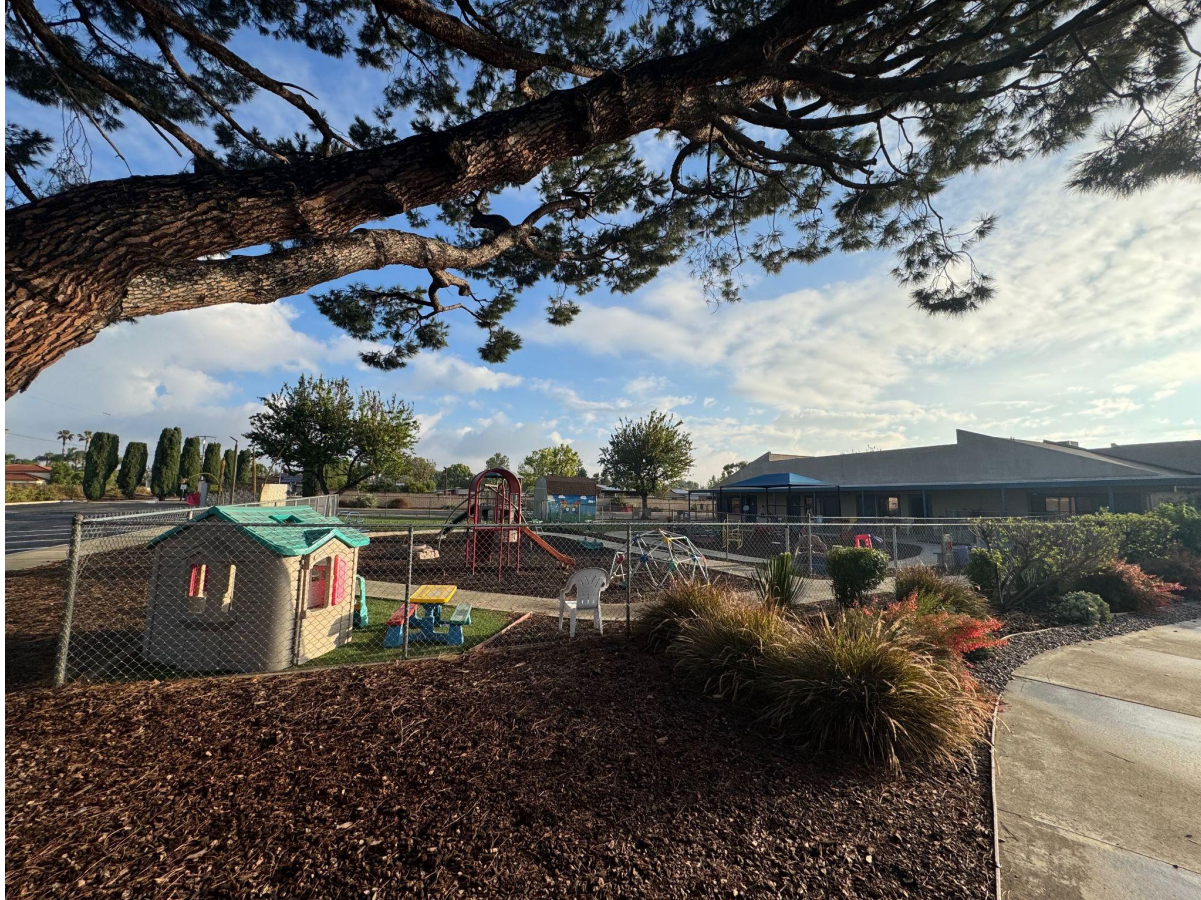
View of Play Area 1 from walkway