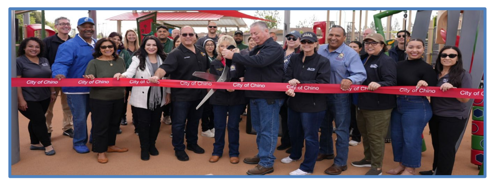
<u>Community Support Services ~ Human Services ~ Neighborhood Services ~ Parks & Facilities ~ Recreation Services ~ Senior Services</u>