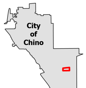
Exhibit A Tract Map No. 16420-7